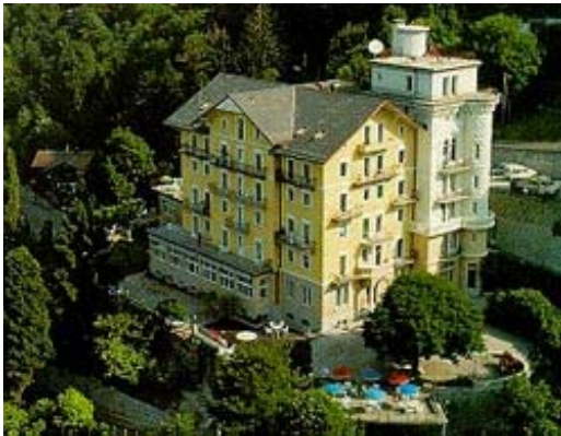
SURVAL MONT FLEURI 56, rte de Glion CH 1820 Montreux Switzerland

The building is located above Montreux, therefore, it suits mainly for people coming with their car (free parking space) or willing to take a taxi at the end of the day. A taxi ride from the centre of Montreux until the Surval House will cost around CHF 25.- (or €16.-) and can be shared between 3 or 4 people.